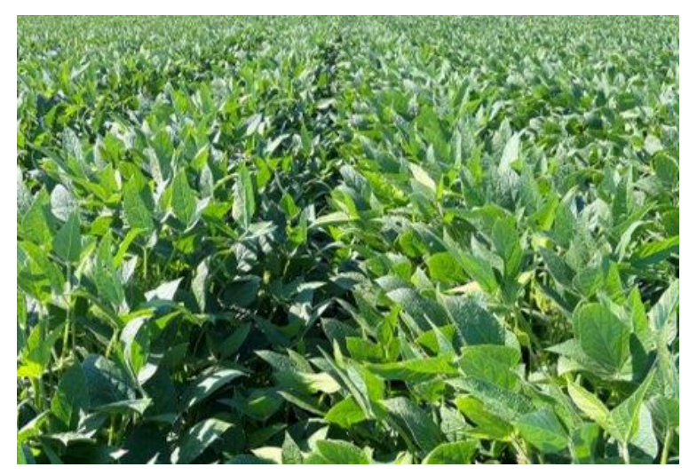
P48A14E™ at Harvest