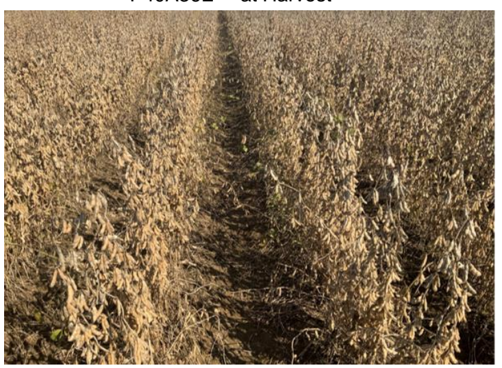
Performance of P40A36E™ vs. Asgrow XtendFlex