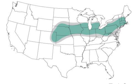
Area of Adaptation

Scan the code for additional Pioneer brand Aseries Enlist E3<sup>®</sup> soybean varieties.