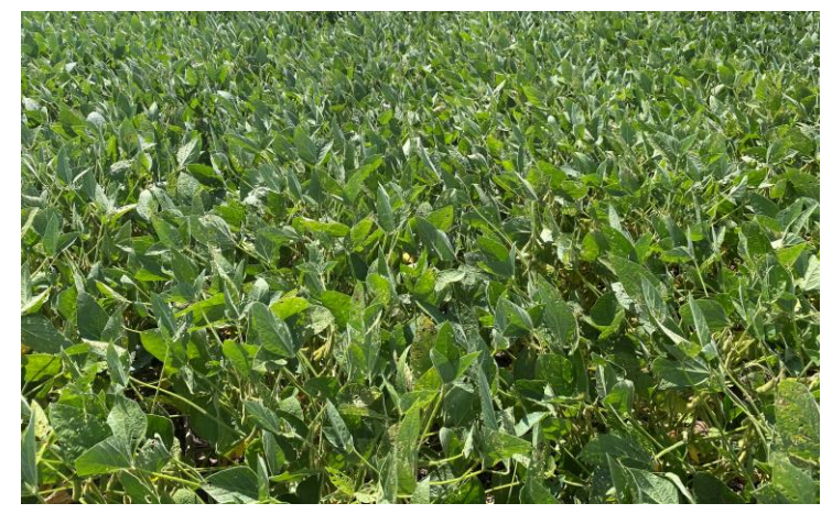
P17A87E<sup>™</sup> at Harvest

P17A87E<sup>™</sup> Mid-Season Growth Habit