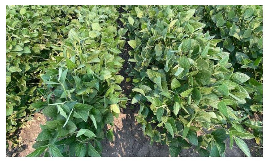
P04A98E<sup>™</sup> at Harvest

P04A98E<sup>™</sup> Mid-Season Growth Habit